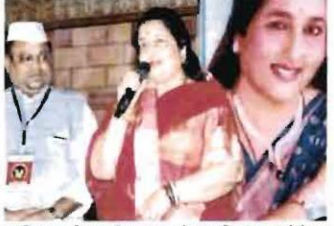
व्यवसायिक वाद्यवृंद निर्माता संघाचे 'पाऊले चालती' कार्यक्रम. व्यवसायिक वाद्यवृंद निर्माता संघाचे 'पाऊले चालती' कार्यक्रम...