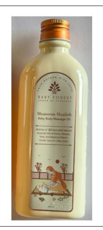
Bottle back view