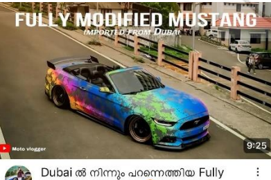
Modified Mustang 😡 Moto Vlogger · 111K views · 8 days ago

Despite the specific directions contained in the orders of this 27. Court in SSCR No.20 of 2021, such vehicles brought through to India through Carnet are being used in public places, including college campus in connection with 'auto shows', posing threat to the safety of other road users is evident from the screenshots of videos recently posted by the vlogger by name 'Moto Vlogger', which are reproduced hereunder;