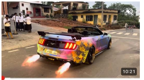
Manjeri Medical College Auto Show Moto Vlogger · 91K views · 12 days ago